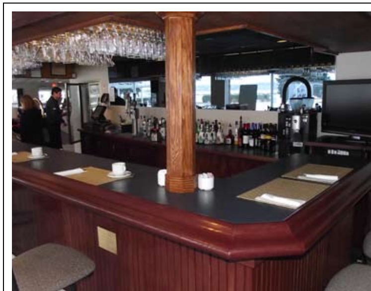
Is there a more inviting picture than this: an open space at the bar for lunch, dinner or a liquid libation.