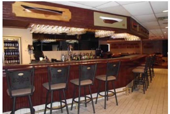
The new bar is warm and inviting on a cold winter's night, claim your place now before the summer crush.

Thanks, Harold Higginbottom. Phone # 905 5284678