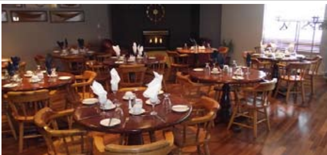
This photo was not taken on a 2-for-1 Thursday night. If it had been we'd have never been able to see the beautiful place setting through all the people.