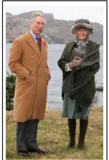
His Royal Highness the Prince of Wales expressed regret at not having been able to visit RHYC on his recent visit to Hamilton with the Duchess of Cornwall.

Hamilton Harbour and Lake Ontario. I was also privileged to be able to introduce myself to our Governor General Michaëlle Jean and had a short discussion with her as well. I thanked her for the gracious invitation extended to me and praised her on her great work as the Governor General of Canada. Earlier in the day I also attended the Remembrance Day ceremonies at Confederation Square. It was a very moving experience. Prince Charles is our royal patron and so it was a great honour and privilege to represent our Club at this memorable event.