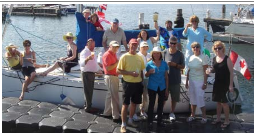
Slips on Slips 2010 was a much needed event considering the heat and beautiful weather in June.