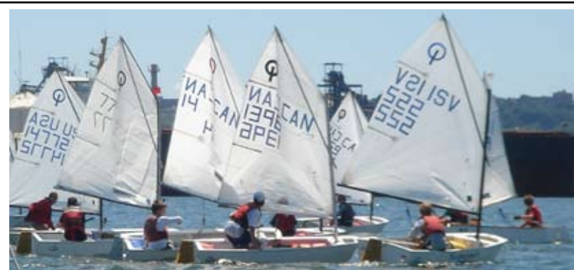
Optimists take off during one of the starts during the Fogh Boorman Regatta. More great Opti racing to come to RHYC in August!